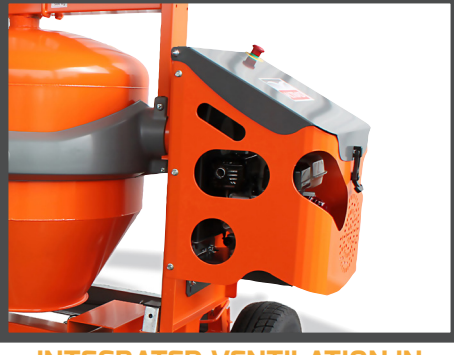
INTEGRATED VENTILATION IN ENGINE CANOPY

ALTRAD BELLE Sheen, Nr. Buxton, Derbyshire, SK17 OEU, GB Tel. +44 (0)1298 84606 - Fax +44 (0)1298 84722 Email: sales@altrad-belle.com www.Altrad-Belle.com www.Altrad-Belle247.com